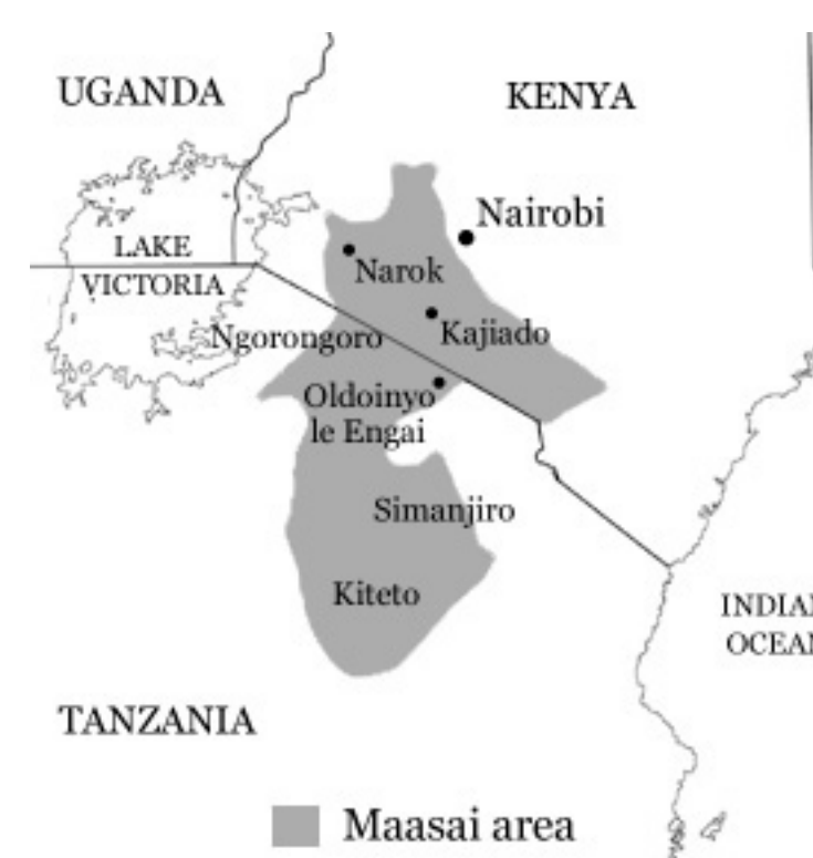
Maasailand Map