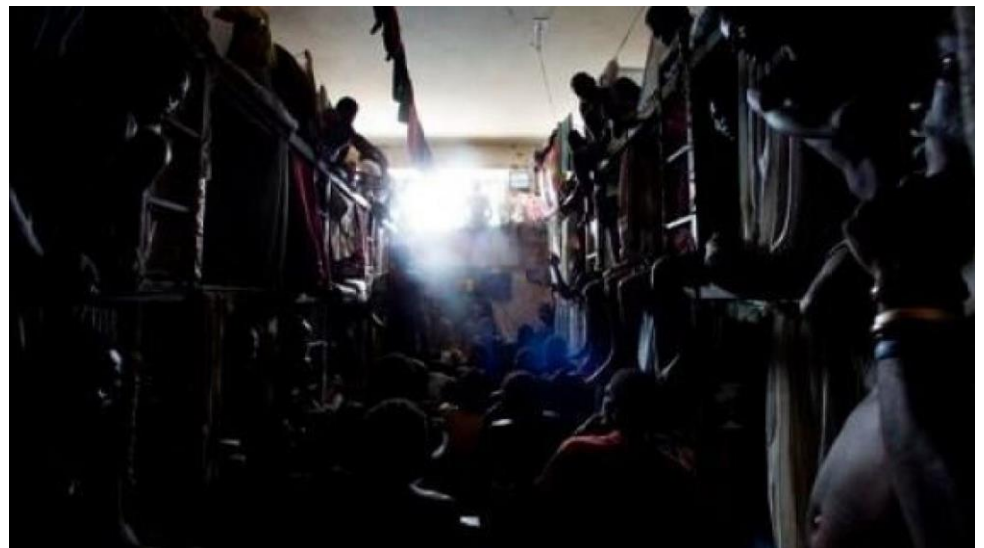
Haiti's prisons so overcrowded there is hardly room to sleep.

Master's in Development Practice (MDP) Program, University of Arizona